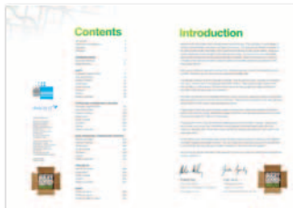
Contents & Introduction

See below to view The Australian Bulky Goods Directory 2011/12 contents, introduction and sample pages, and to download an order form.